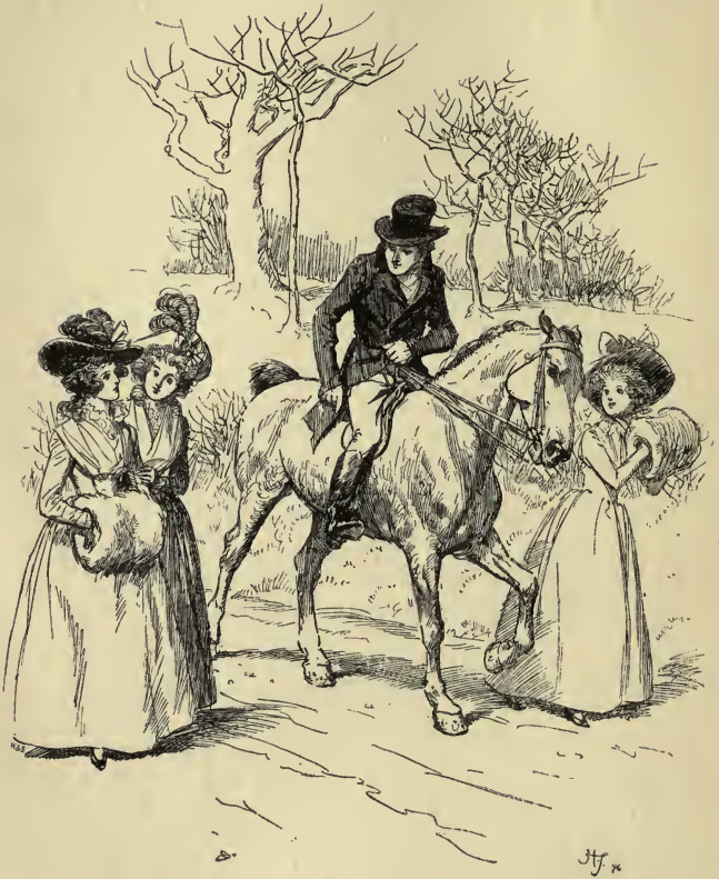
Begging her to stop.